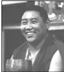
Khenchen Konchog Gyaltsen Rinpoche

OM SWASTI/ KONCHO G TSA SUM GYA TSO'I TU CHIN GYI/ By the blessing power of the ocean-like three precious jewels and three roots, TEN DZIN DRUB CHOG KYE BU'I SHAB TEN CHING/ May the greatly accomplished Dharma-Holder live long! LAB CHEN TRINLAY NGANG WA RAB GYE TE/ By spreading the light of universal activity, SA SUM TRA SHI SAL GYI TAG KY'AB SHOG/ May the three realms of existence be pervaded everlastingly with the auspicious glory.