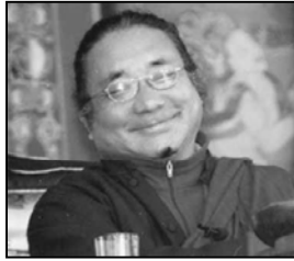
Drigung Ontul Rinpoche

OM SWASTI/ KONCHO G TSA SUM GYA TSO'I TU CHIN GYI/ By the blessing power of the ocean-like three precious jewels and three roots, TEN DZIN DRUB CHOG KYE BU'I SHAB TEN CHING/ May the greatly accomplished Dharma-Holder live long! LAB CHEN TRINLAY NGANG WA RAB GYE TE/ By spreading the light of universal activity, SA SUM TRA SHI SAL GYI TAG KY'AB SHOG/ May the three realms of existence be pervaded everlastingly with the auspicious glory.